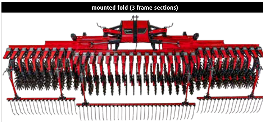
mounted fold (3 frame sections)